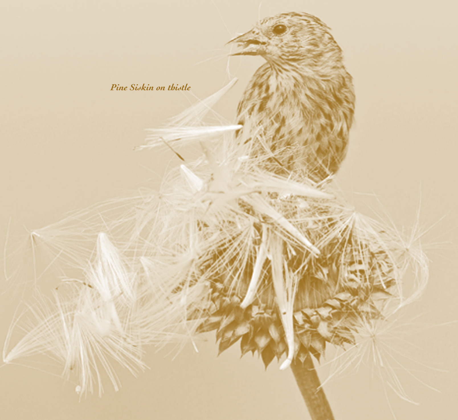
Pine Siskin on thistle