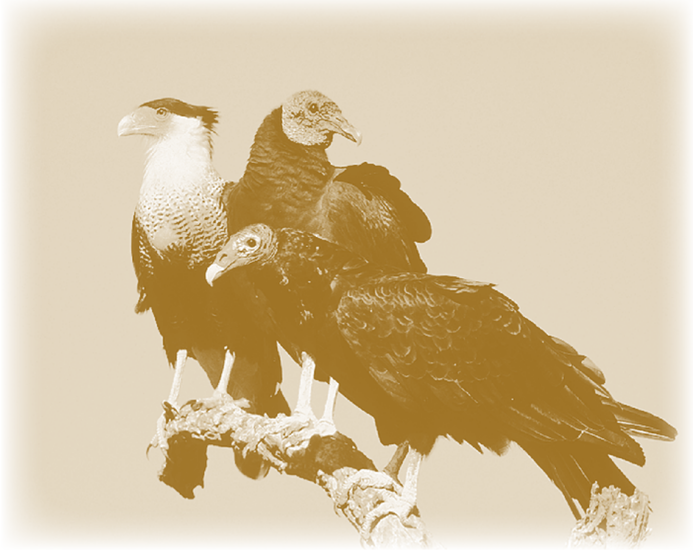
Good photo, easy birds