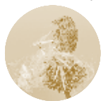
Pine Siskin on thistle; at Becker Lake, AZ, August 6, 2005 with Canon EOS 1D body and Canon 600mm f/4 lens.