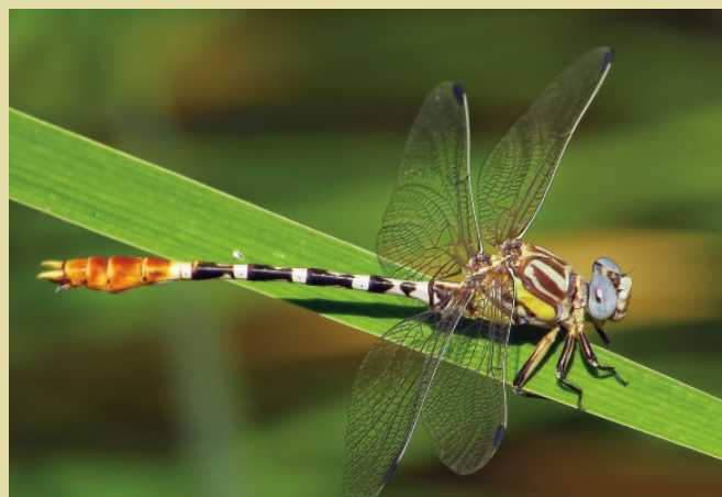
White-belted Ringtail - Erpetogomphus compositus - Male