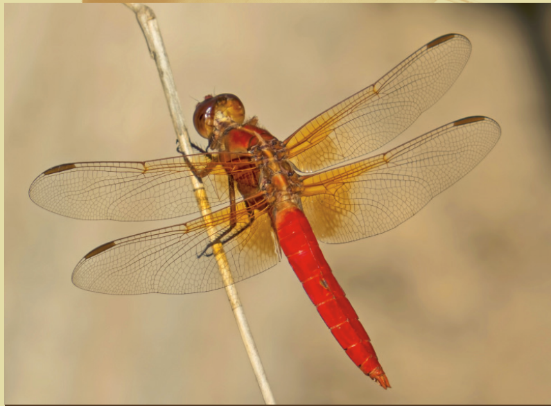
Neon Skimmer - Libellula croceipennis - Male

But as is the case for birds, odonate observation and photography are not only fun and enjoyable, but also serve the purpose of documenting the presence of these organisms in space and time. This information can then be “officially” entered into the OdonataCentral