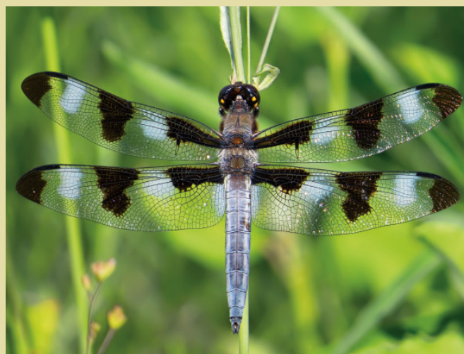
Twelve-spotted Skimmer - Libellula pulchella - Male

Arizona is endowed with approximately 135 odonate species, a number that is relatively small when compared to the more than 450 North American species. And over 180 species are found in the state of Maryland and the District of Columbia even though the combined area of these two regions is much smaller than that of Arizona! As another example, Maricopa County has an official list of about 70 odonate species but is home to around 150 breeding bird species. However, numbers are not everything and there are many reasons why odonates deserve our attention. One of these is that a substantial proportion of Arizona odonates are primarily Mexican species that reach the northern limit of their distribution here and are found nowhere else in the country. Looking for these will take you to some of the most spectacular and biologically interesting locations that our state has to offer, such as Sycamore Canyon, California Gulch, and canyons of the Huachuca Mountains. Arizona has a great diversity of ecosystems ranging from alpine lakes