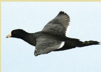
An American Coot in flight, a rare sight, captured by professional photographer Jerry Ting in 2006