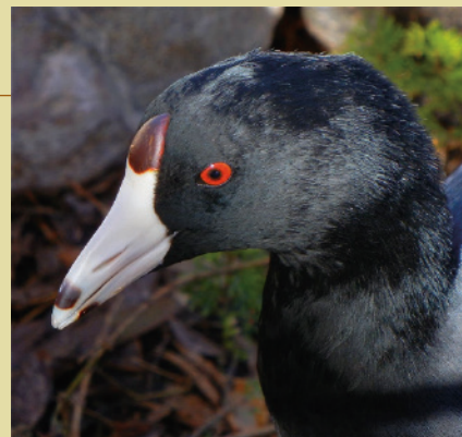
Coots, sometimes called "mudhens," have a white, chicken-like beak adapted for feeding on vegetation.