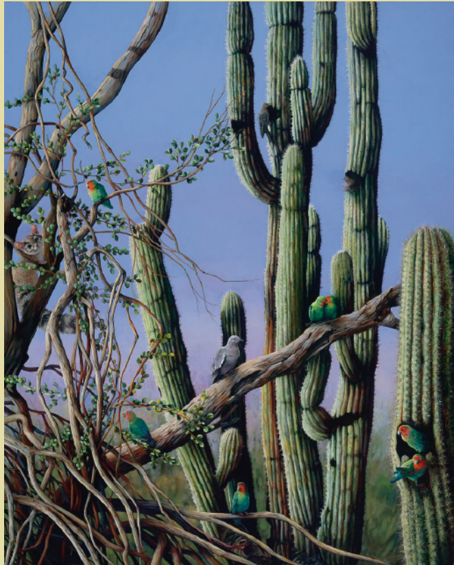
Trouble in Paradise 60" x 48" Acrylic on canvas

Inside the squares of tile and curves of pottery exists a universe of subtle variation, texture, and color, each inch a pleasure to visually explore. The potted aloe's surface shimmers with colors that move in a stream of dots and dashes that burst into the atmosphere and off into the cosmos. The rug is alive with a multitude of tiny brush strokes ready to break free. The collection of adored items is still in comparison, but the rabbit sculptures from Oaxaca are embellished with a constellation of dots that complement the aloe's cosmic presence. The man-made objects are just as alive with movement as the living plants and rabbit. It is not just a still life. Examine it closely. All seems to be contained within its structures now, but soon will break apart into atoms and radiate out into the atmosphere, just as the aloe is now doing. Dots of color moving like life force.