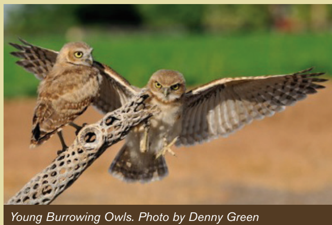
Young Burrowing Owls.

All of a sudden, the one on our right flopped down on the ground and played dead, with one foot held limply in the air. We figured this