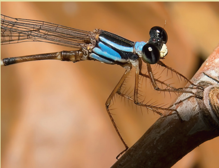
Desert Shadowdamsel - Palaemnema domina - Male

Odonates also are ideal subjects for nature photographers. They vary greatly in size, ranging from the tiny forktails that forage in grassy areas to the Giant Darner, the largest North American odonate. Many species are every bit as colorful and spectacular as our brightest birds, a feature that is reflected in their names: Neon Skimmer, Cerulean Dancer, Desert Firetail, Fiery-eyed Dancer, and many others. In addition, they are often approachable and thus also easily photographed. Even casual observers readily notice that many odonates prefer to perch relatively low and out in the open.