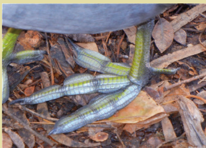
Coot feet have flexible lobes along their toes that aid in propulsion when swimming and help support them when walking along muddy shorelines.