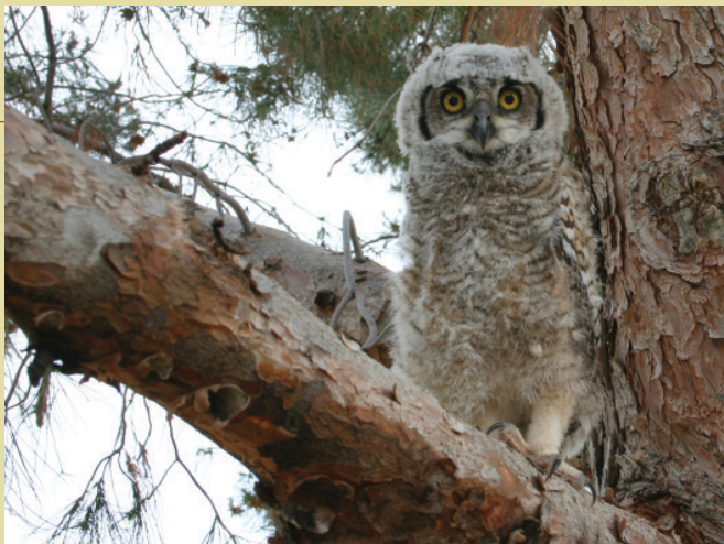
Fledgling Great Horned Owl.

D uring winter's long nights there's always a chance that a supreme predator may perch awhile on your rooftop. The Great Horned Owl kills for a living, employing frightful talons capable of squeezing 80 pounds of pressure. These weapons are enforced against a wide range of meek creatures from centipedes and small snakes to rats, mice, cottontail rabbits, and skunks. Even hawks and falcons asleep on their roosts are vulnerable.