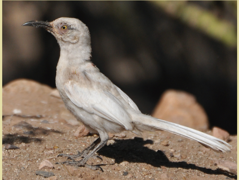
Curve-billed Thrasher.

Sunrise is at 5:30 am on June 17; it took till 8:15 am before I got my first view and after only a few shots, the thrasher was gone. It did come back though, several times. The encounter caused me to do more research, which led me to David Sibley's website,