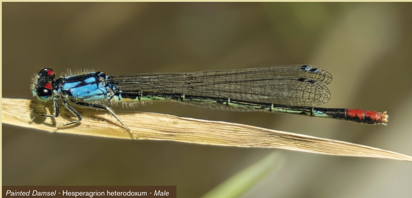
Painted Damsel - Hesperagrion heterodoxum - Male

M id-summer may not be what most Arizona birders think of as the most exciting time of the year. At this time temperatures in the low deserts soar, often limiting outdoor activities to a few early morning hours. And although some monsoon-dependent bird species are then most vocal and in full breeding condition, many others are already completing their breeding cycles, becoming noticeably more difficult to find than in spring and early summer. Furthermore, northbound migration is generally over while "fall" migration has not begun. Yet much can be gained from braving Arizona heat! One reason is that summer and early fall are prime seasons for observing and studying our damselflies and dragonflies, collectively called odonates.