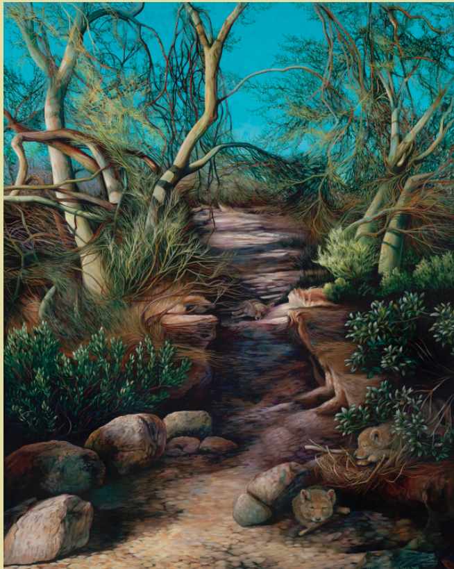
Guarded Treasure 60" x 48" Acrylic on Canvas