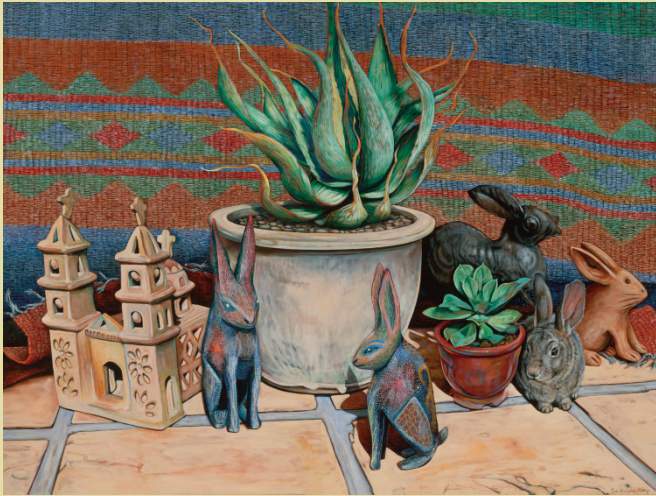
Cosmic Aloe Amidst Treasures 36" x 48" Acrylic on Canvas

Inside the squares of tile and curves of pottery exists a universe of subtle variation, texture, and color, each inch a pleasure to visually explore. The potted aloe's surface shimmers with colors that move in a stream of dots and dashes that burst into the atmosphere and off into the cosmos. The rug is alive with a multitude of tiny brush strokes ready to break free. The collection of adored items is still in comparison, but the rabbit sculptures from Oaxaca are embellished with a constellation of dots that complement the aloe's cosmic presence. The man-made objects are just as alive with movement as the living plants and rabbit. It is not just a still life. Examine it closely. All seems to be contained within its structures now, but soon will break apart into atoms and radiate out into the atmosphere, just as the aloe is now doing. Dots of color moving like life force.