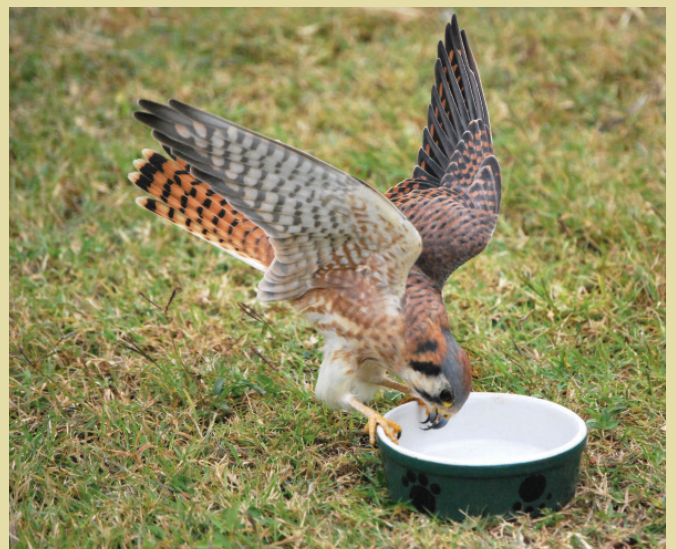
American Kestrel taking mealworm from bowl.