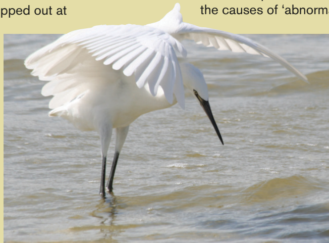
White-morph Reddish Egret.

Dr. Clay Green of Texas State University researches the ecological significance of plumage coloration in herons and egrets. White plumage may confer a foraging advantage in open (unvegetated) water habitat