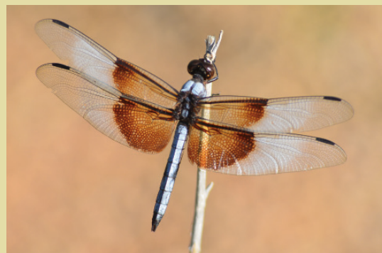
Male Widow Skimmer.