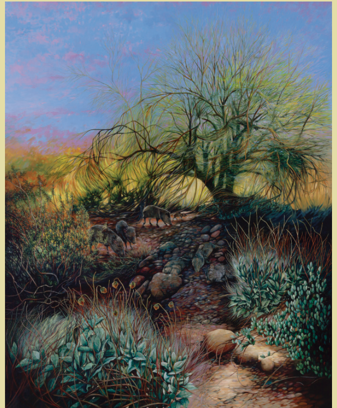
The Shadows Slumber 60" x 48" Acrylic on Canvas

Most movement in the desert is visible when the breeze pushes through the trees. The air streams like water through the dry wash bed. Even in the summer, it is noticeably cooler at dusk in the silent river of its dry, sandy bed. Time and light shift through the trees, as life rests waiting for nocturnal adventures. But movement in the brush along the wash bank occurs, because it is hard for young treasure to stay completely still. Seemingly in repose, hidden in shadow, the color of granite and sand, the guardian watches always.