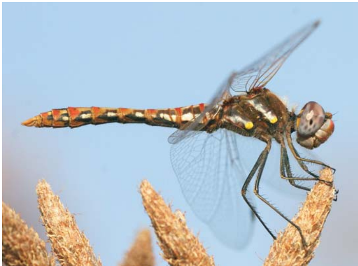
Variegated Meadowhawk, Sympetrum corruptum

For years Maricopa Audubon has conducted reptile and butterfly field trips as well as bird trips. But with the arrival of close-focus binoculars, user friendly field guides and digital cameras, nature enthusiasts and birders have found identifying and photographing butterflies