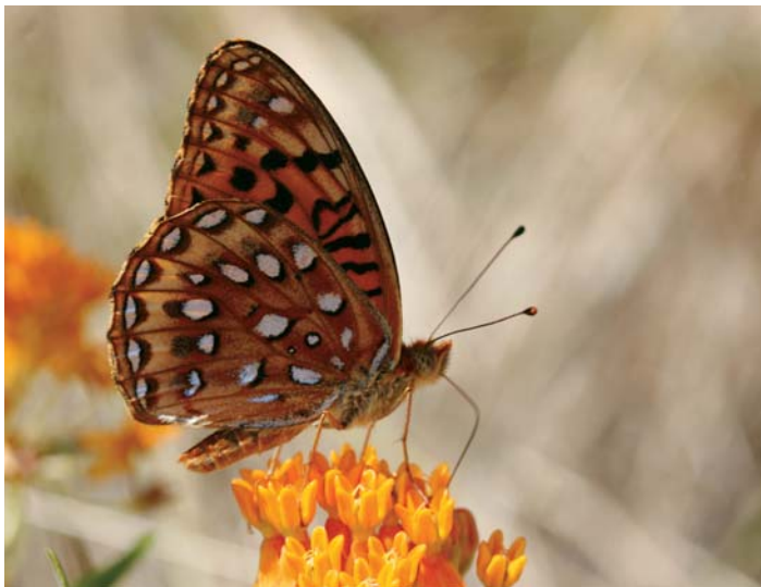
Atlantis Fritillary, Speyeria hesperis