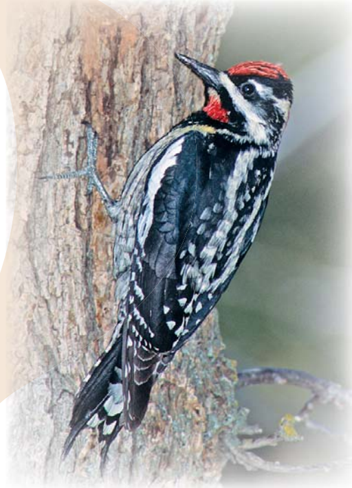
B) Good photo, easy bird