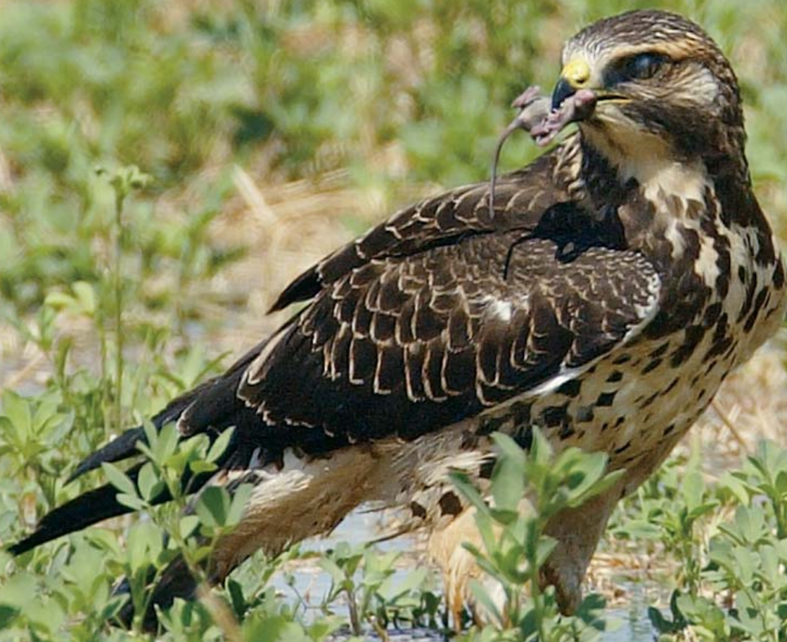
Swanson's Hawk with mouse