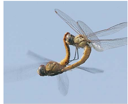
Wandering Gliders, Pantala flavescens , photo by Pete Moulton.

This amazingly skillful, stop-action photo of mid-air copulation by Moulton documents a remarkable process. Moulton points out: "The male captures the female behind her head with his terminal appendages. There's a theory that the female has strategically placed nerve endings in that area that, when properly contacted by the male's appendages, cause her to go into the breeding mode. Meanwhile, the male curls his abdomen underneath itself, and extrudes a sperm packet from his 9th abdominal segment onto the auxiliary genitalia on the underside of his 2nd abdominal segment. When the female is properly stimulated, she curls her abdomen under his to bring her 8th segment into apposition with his second segment, and the sperm transfer occurs. It takes anywhere from a couple of minutes to over an hour for the transfer, and during that time the male can remove any sperm packet placed in the female by a previous male. That ensures that his genes go forward. The male is the one with the wings propelling the couple. The female wings are still.