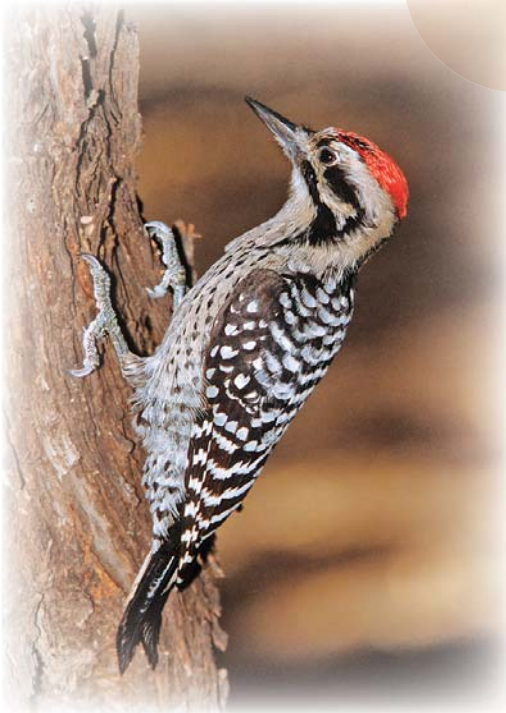
A) Good photo, easy bird

Vertical posture, zygodactyl toes, stiff, supportive tail feathers, huge, chisel-shaped bills. I don't think we'll need to spend any time figuring out which family these birds belong to. All were photographed in Arizona. After you get the easy part, the species, see how you fare with a greater challenge. Are they male or female?