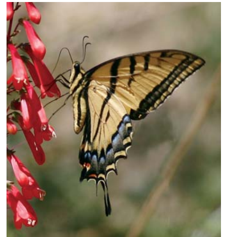
Two-tailed Swallowtail, Papilio multicaudata (official butterfly of the state of Arizona), photo by Marceline VandeWater.

For user friendly dragonfly books, we are only gradually emerging from the dark ages. Maricopa Audubon, at our monthly meetings and dragonfly field trips, sells an excellent local guide: "Common Dragonflies of the Southwest," by Kathy Biggs ($10). Another guide, "Dragonflies