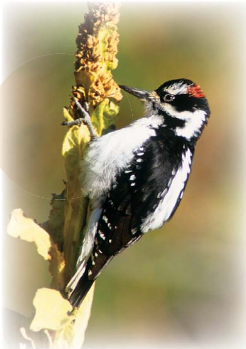
C) Good photo, difficult bird