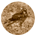
Juvenile Swainson's Hawk with mouse; near Marana, AZ, September, 2007, with Canon EOS 1D body and Canon 600mm f/4 lens.

It is a victory like this that keeps the fires burning for our passion for the environment. Unfortunately, conservationists can never rest on their laurels. But, please take a moment to savor this.