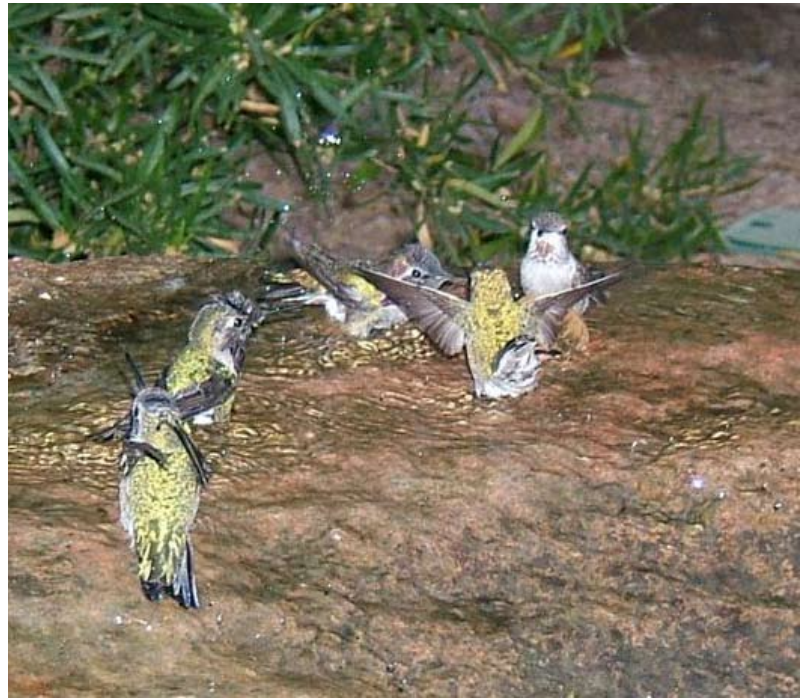
Hummingbirds bathing at dawn at the Desert Botanical Garden.

the scenes" in back of the Horticulture building. One December morning I