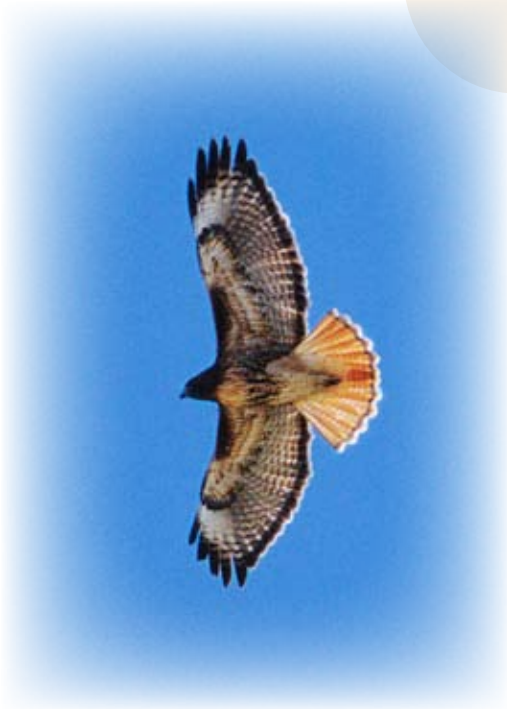
A) Good photo, easy bird

In the agricultural areas of central and southeastern Arizona, winter is raptor time or, even more specifically, buteo time. These three photos typify the scenario--large, broad winged hawks passing directly overhead, backlit by the sun, showing off diagnostic but perhaps confusing underside patterns.