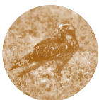
Adult Reeve in basic plumage, at the Gilbert Water Ranch, AZ, October, 2007, with Canon 20D body and Canon 100-400mm IS USM lens.

I hope you enjoy all the articles. Every contributor works hard to provide content for each issue. Believe me, without their help, the Wrendition would not exist. So, here's a BIG thank you for everyone who has ever sent in something for the newsletter.