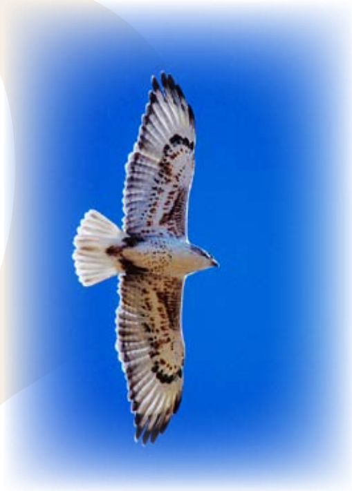
B) Good photo, difficult bird