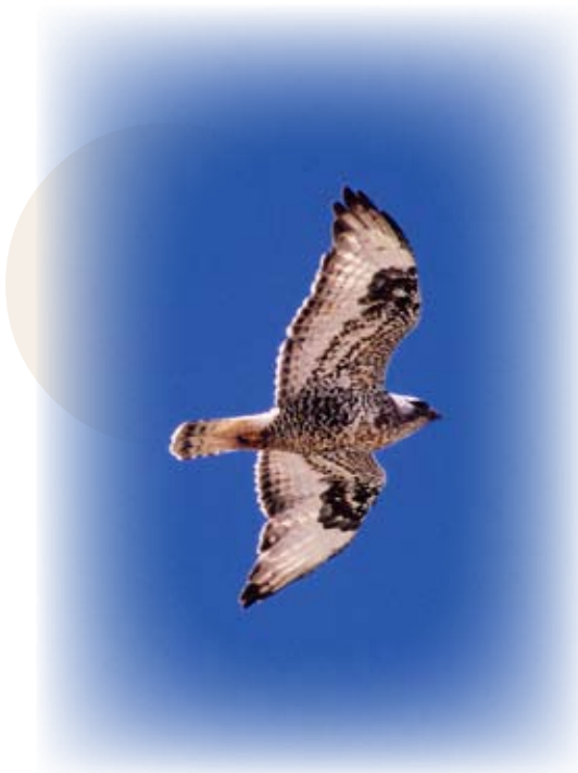
C) Good photo, difficult bird