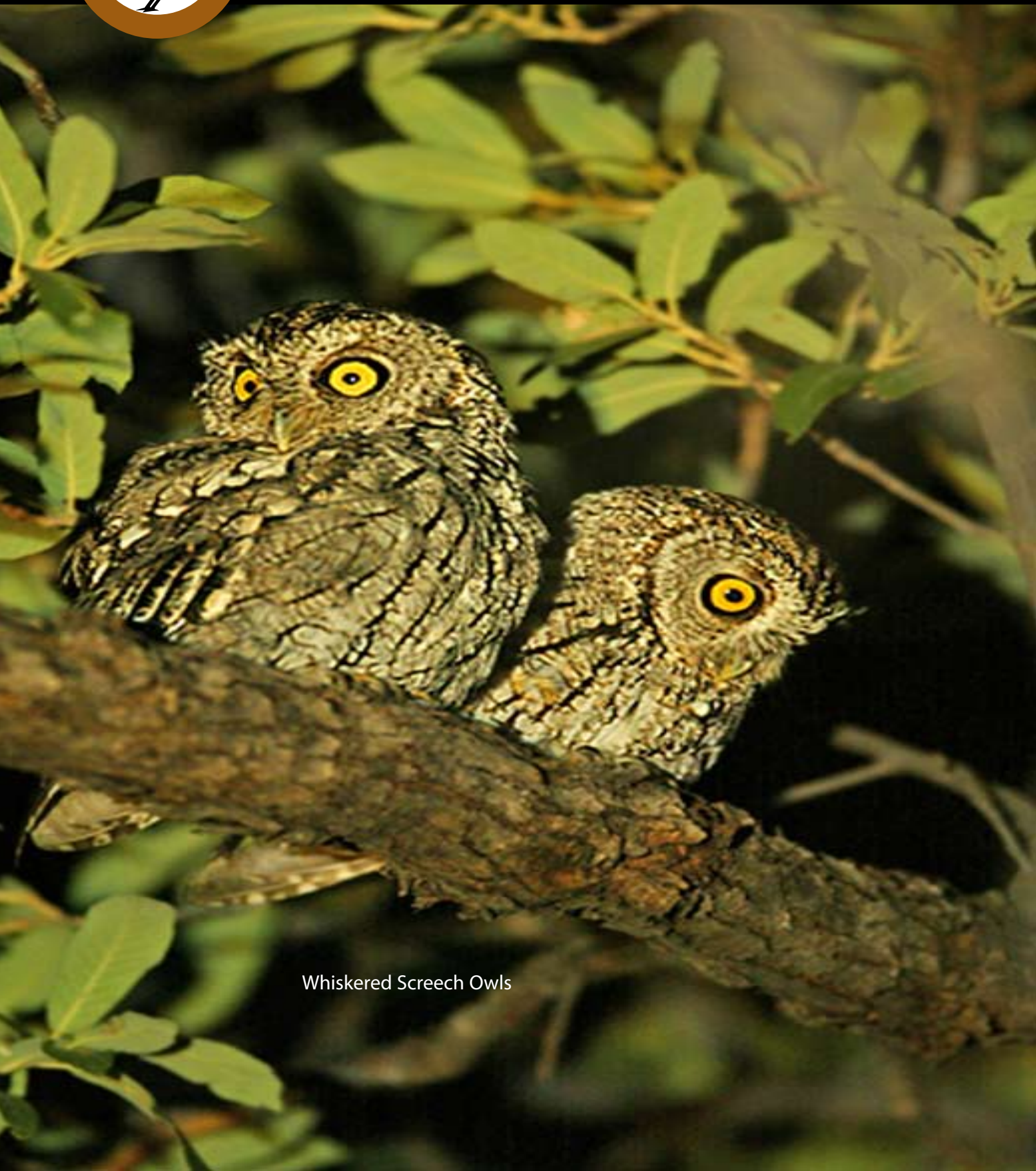
Whiskered Screech Owls