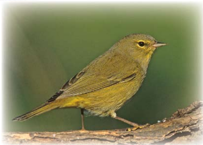
B – Good photo, difficult bird