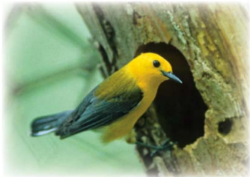
C – Good photo, easy bird