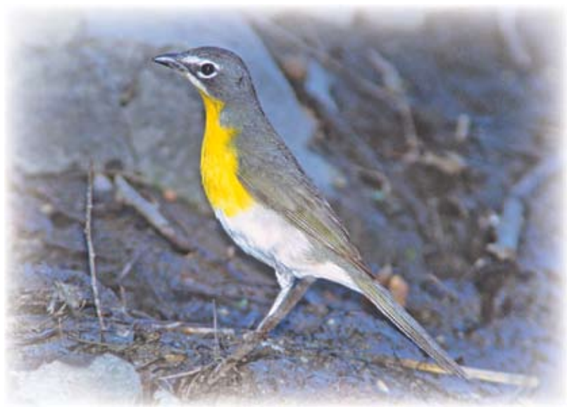
A – Good photo, easy bird

These three species are all in a colorful family of birds that is a seasonal favorite for many of us, and now is that season.